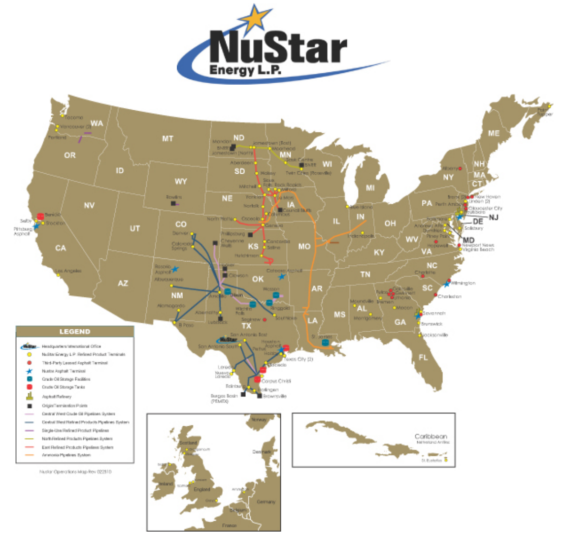
This map depicts our operations as of March 31, 2010