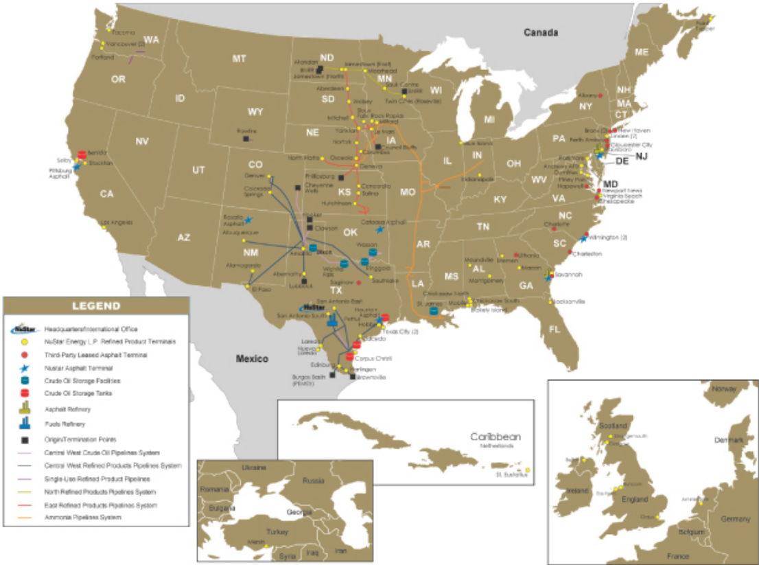
This map depicts our operations as of December 31, 2011.