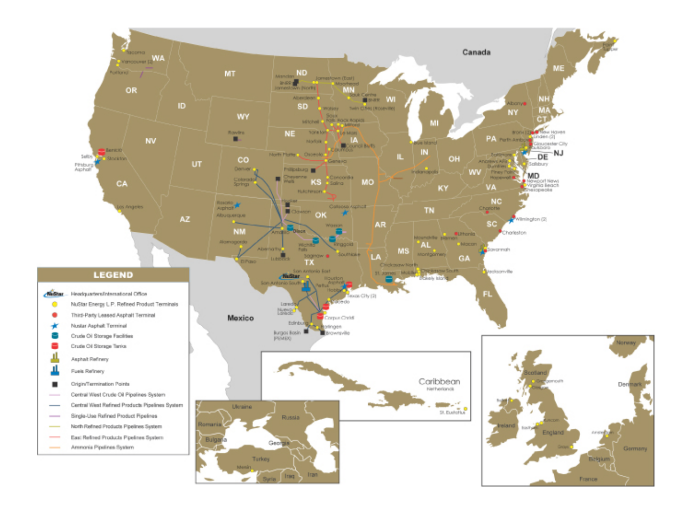
This map depicts our operations as of September 30, 2011.