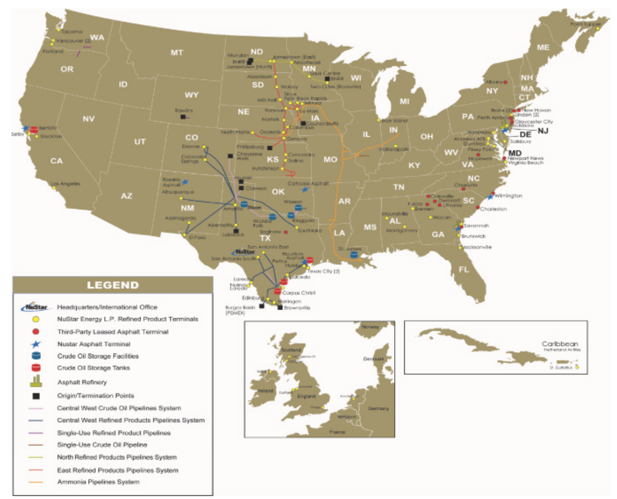
This map depicts our operations as of October 30, 2009